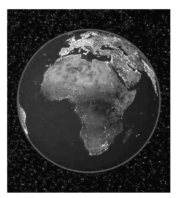
This satellite view of the African continent at night gives a striking picture of the lack of electricity. Although the continent has 12 percent of the world's population, Africa accounts for only 2 percent of the world's energy consumption. More than half of Africa's electricity is produced and consumed by South Africa.

PBMR is a good example because of the spin-offs. For example, we have the fastest computer in the Southern Hemisphere to work with our modeling and to test PBMR systems and equipment. These computers produce models in the virtual world that