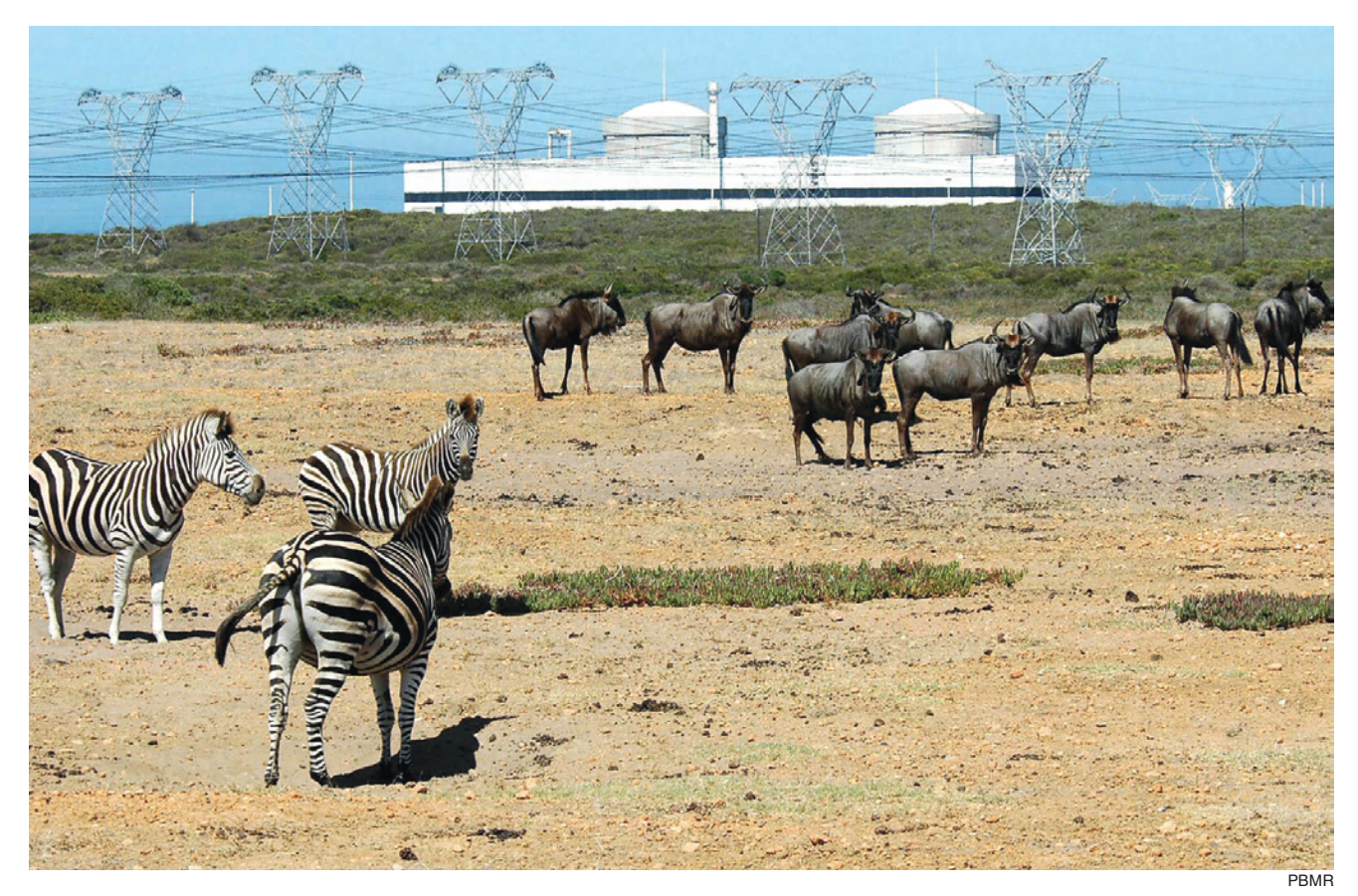
Wildebeest and zebra grazing near the Koeberg nuclear site, where Eskom, the state utility, operates two 900-megawatt pressurized-water nuclear reactors, the only nuclear reactors on the continent. The PBMR demonstration reactor will be built near here. Koeberg is on the coast, near Cape Town.